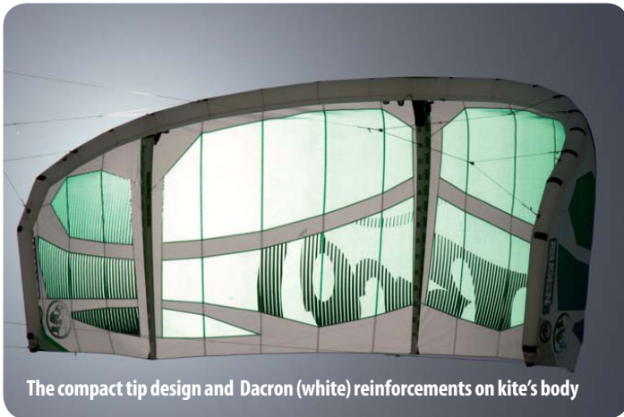
The compact tip design and Dacron (white) reinforcements on kite's body