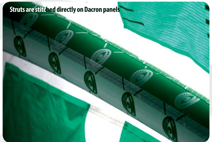
Struts are stitched directly on Dacron panels