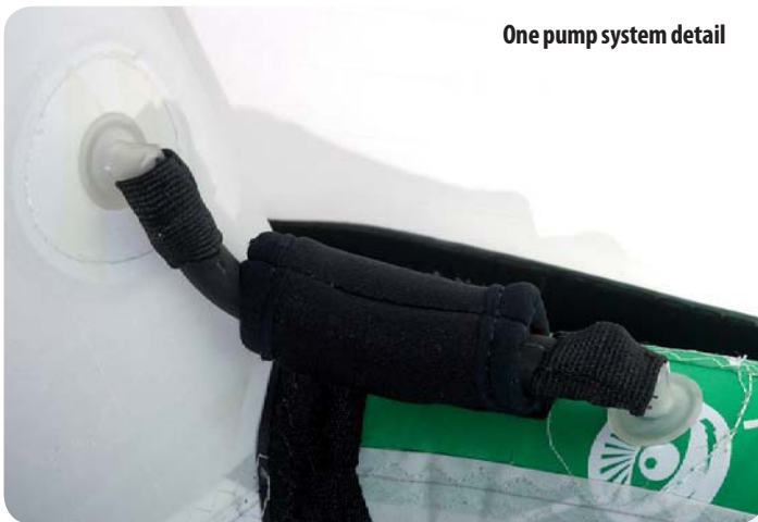
One pump system detail