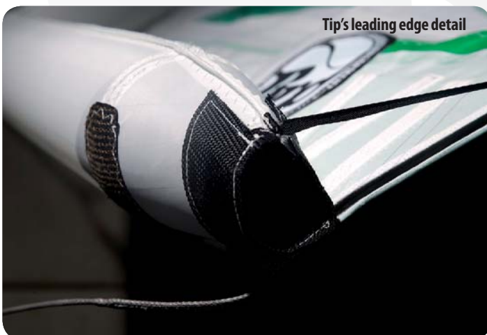
Tip's leading edge detail