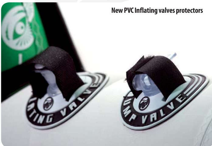
New PVC Inflating valves protectors