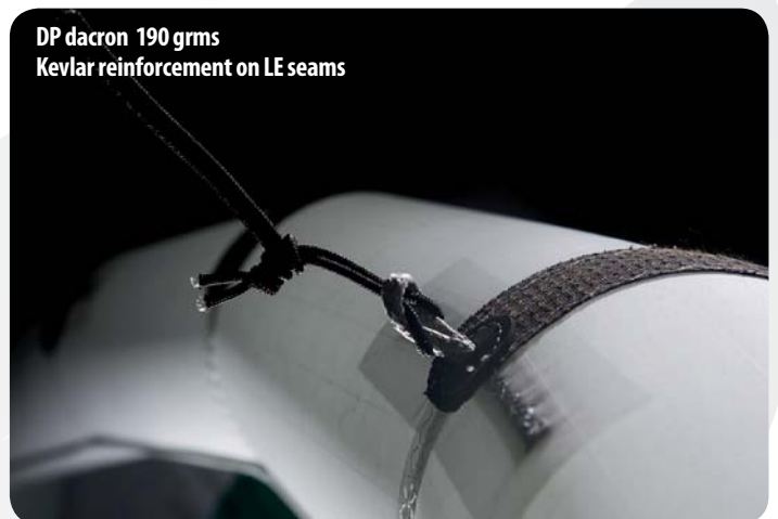
DP dacron 190 grms Kevlar reinforcement on LE seams