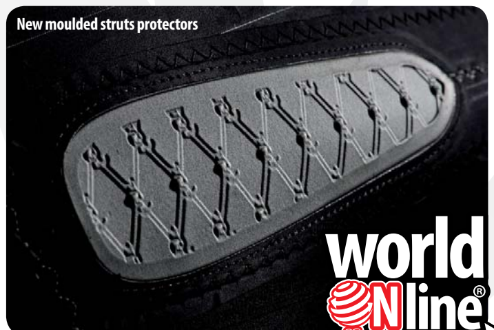
New moulded struts protectors