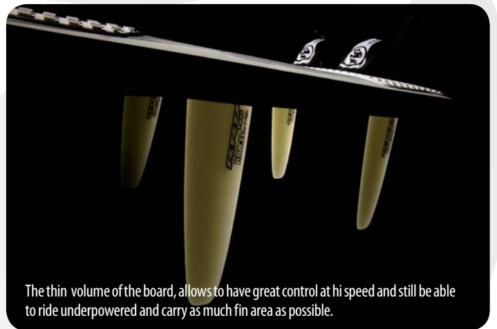
The thin volume of the board, allows to have great control at hi speed and still be able to ride underpowered and carry as much fin area as possible.