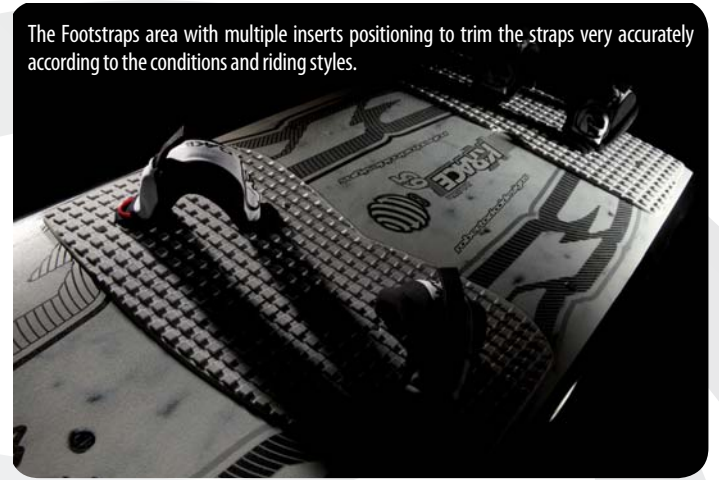
The Footstraps area with multiple inserts positioning to trim the straps very accurately according to the conditions and riding styles.