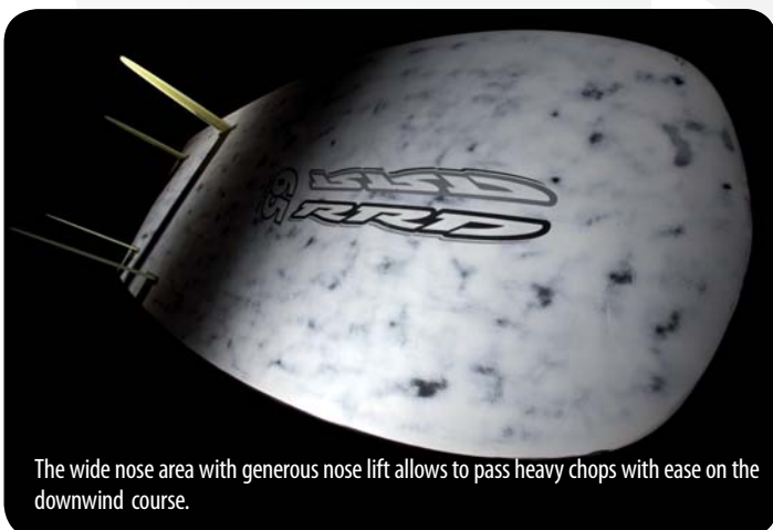
The wide nose area with generous nose lift allows to pass heavy chops with ease on the downwind course.