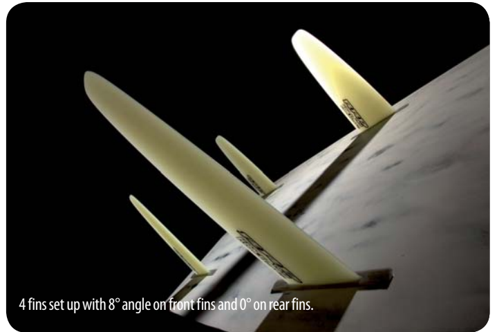
4 fins set up with 8° angle on front fins and 0° on rear fins.