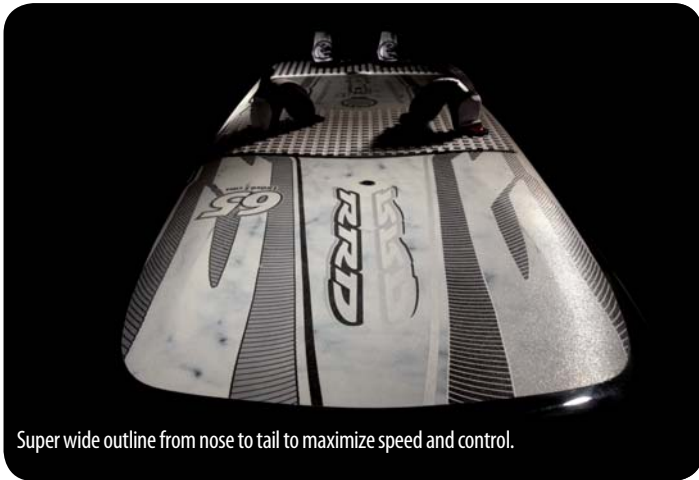
Super wide outline from nose to tail to maximize speed and control.