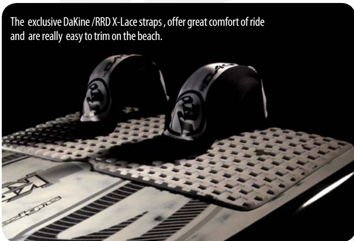
The exclusive DaKine /RRD X-Lace straps , offer great comfort of ride and are really easy to trim on the beach.